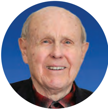
ROGER GROSS COUNCIL