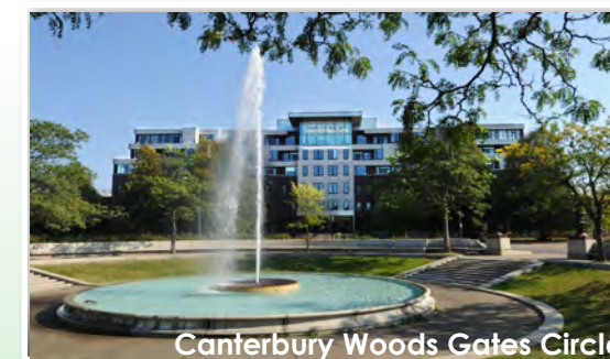
Canterbury Woods Gates Circle