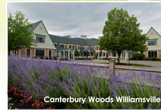
Canterbury Woods Williamsville